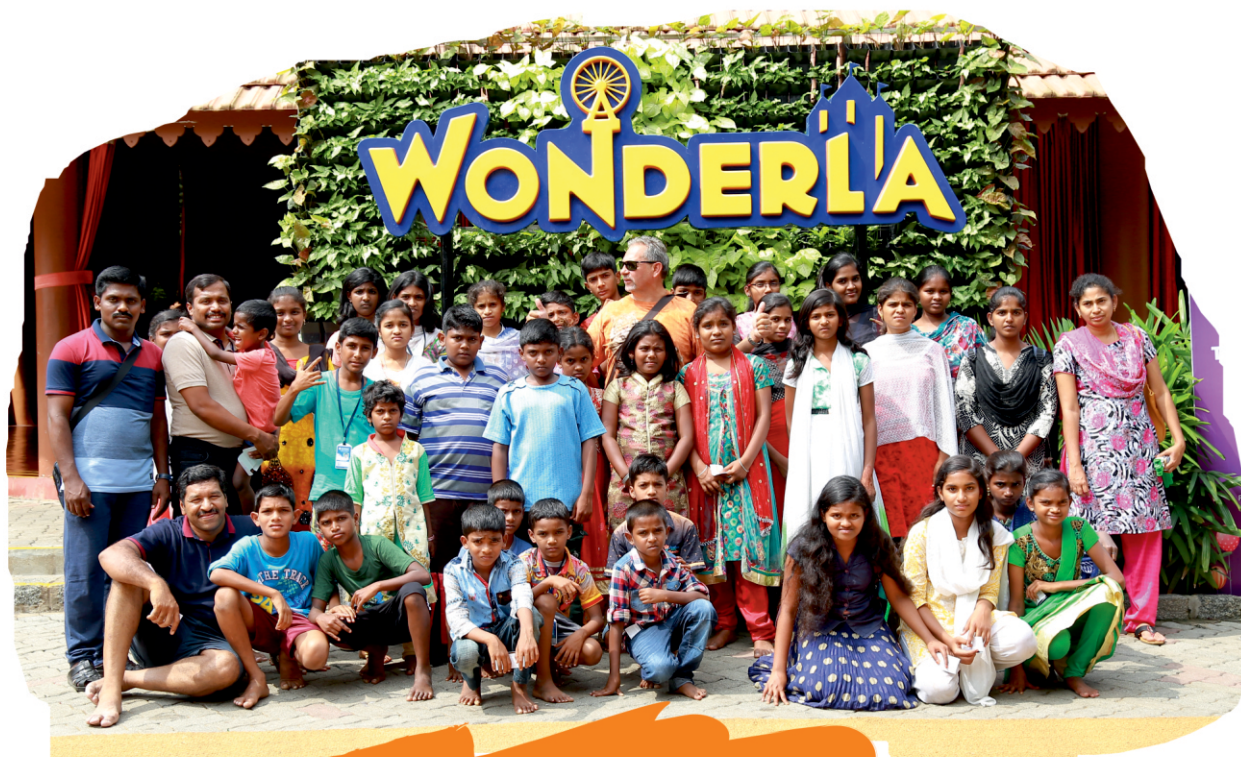
Retreat 2019 From Erode, Tamilnadu to Ernakulam, Kerala